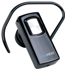
BN-708 Bluetooth Headset